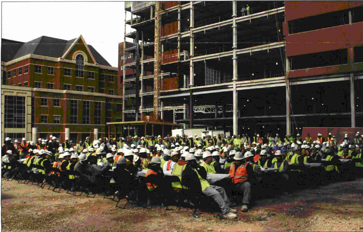
Workers at the Johns Hopkins New Clinical Building site gathered to celebrate reaching a major projects milestone.